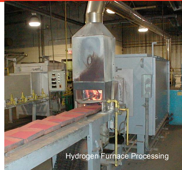
Hydrogen Furnace Processing